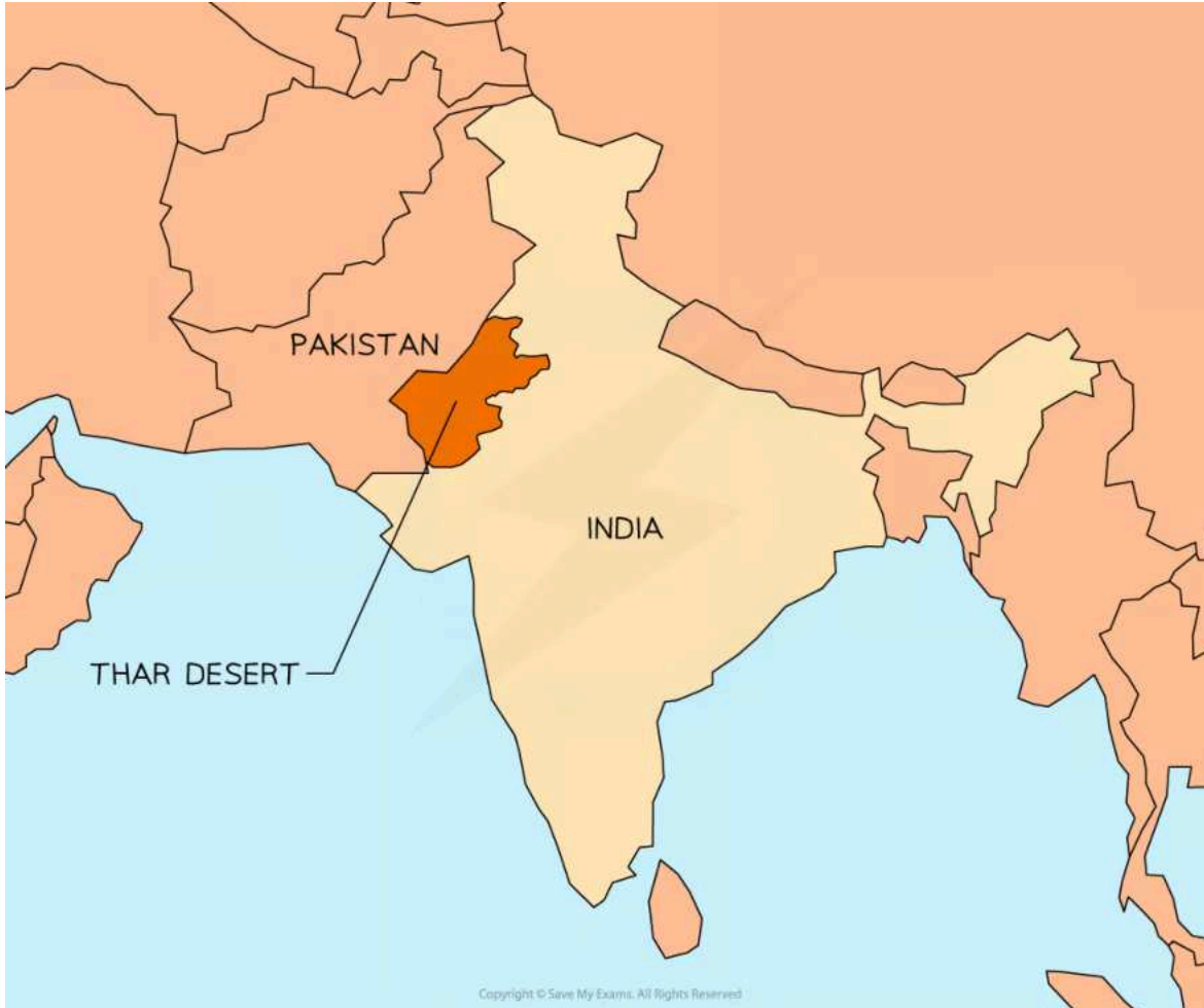
Location of the Thar Desert