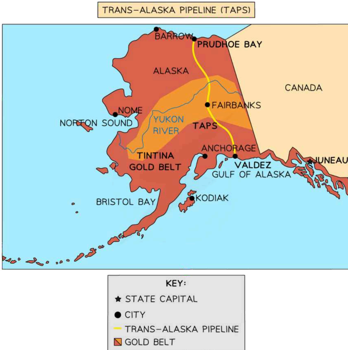
Map of Alaska highlighting the main cities and industrial regions