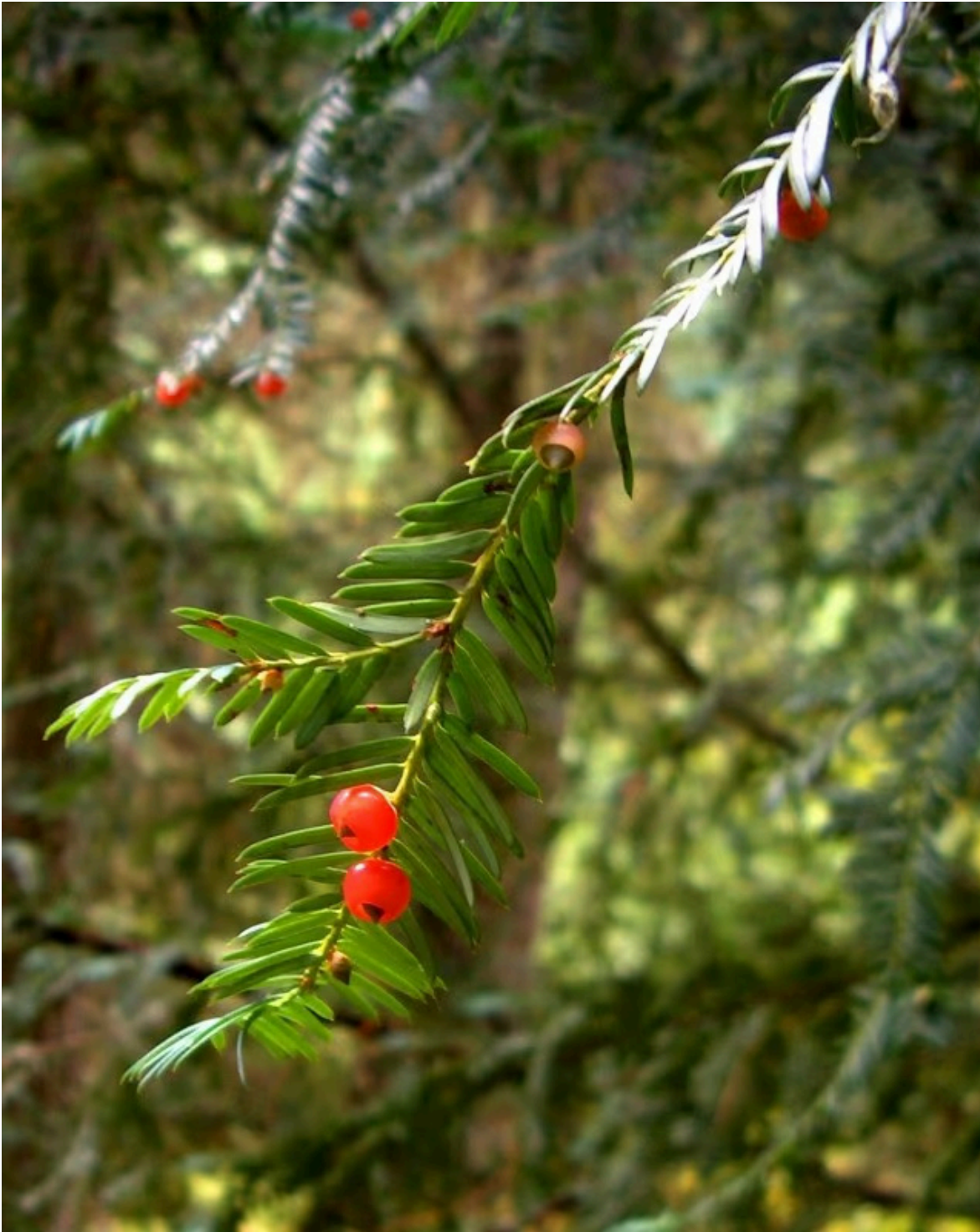
The pacific yew tree is a source of anti-cancer drugs