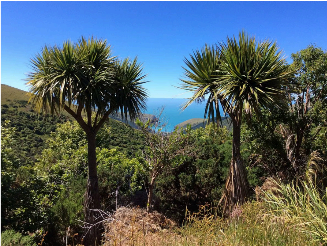
Hinewai Reserve in New Zealand is considered to be an example of successful rewilding