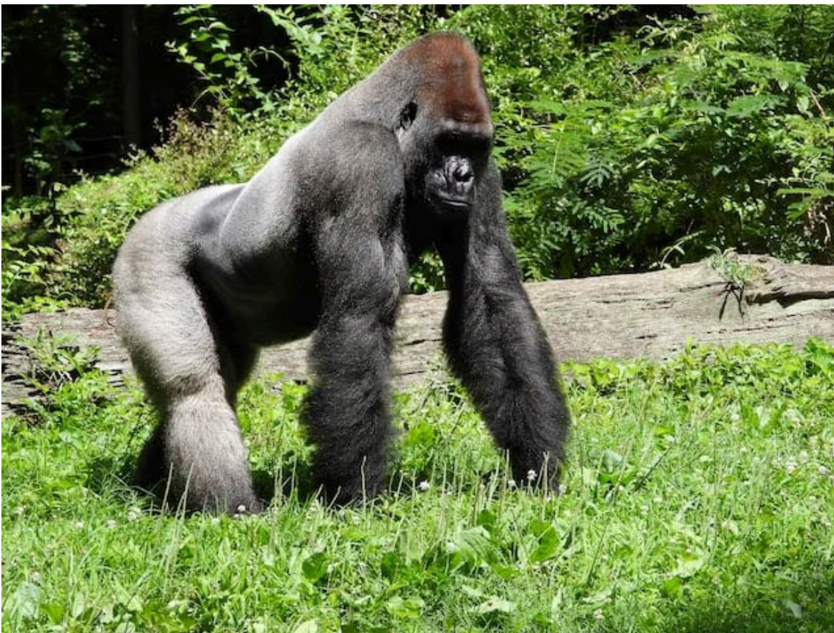
The mountain gorilla is an example of a flagship species