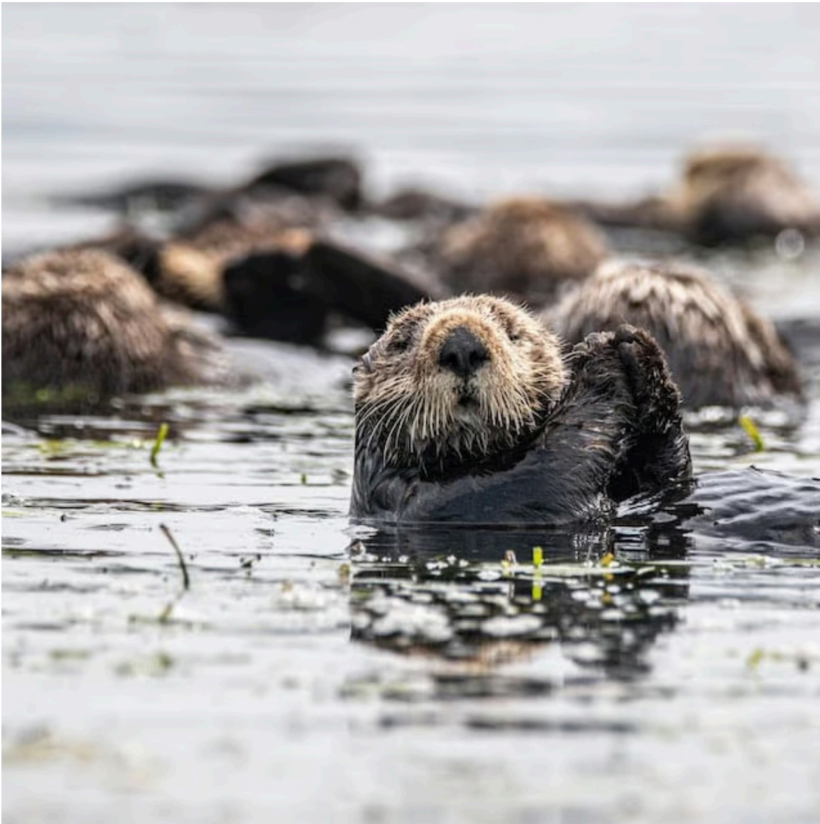
Sea otters are a keystone species