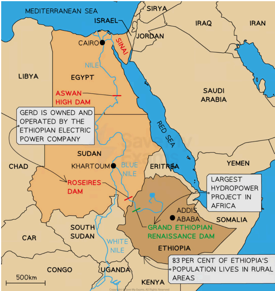
Location of the Grand Ethiopian Renaissance Dam