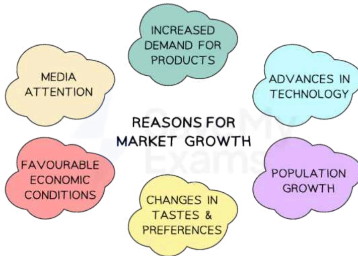
Diagram: reasons for market growth