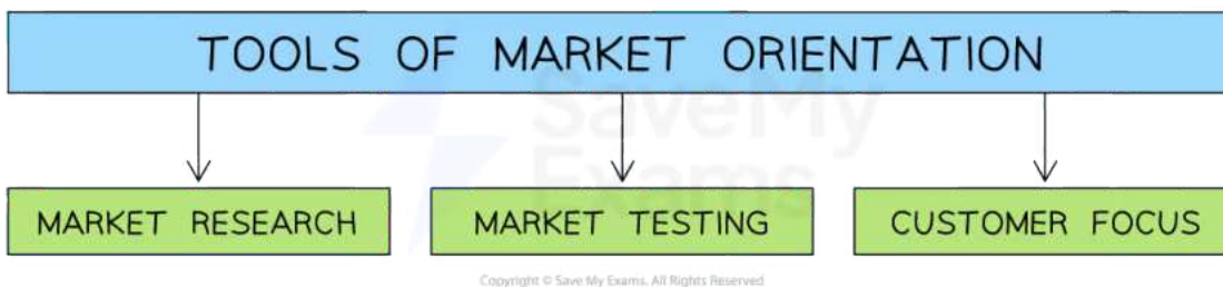
Diagram: tools of market orientation

Market orientation aims to develop products to meet consumer needs identified during the market research process