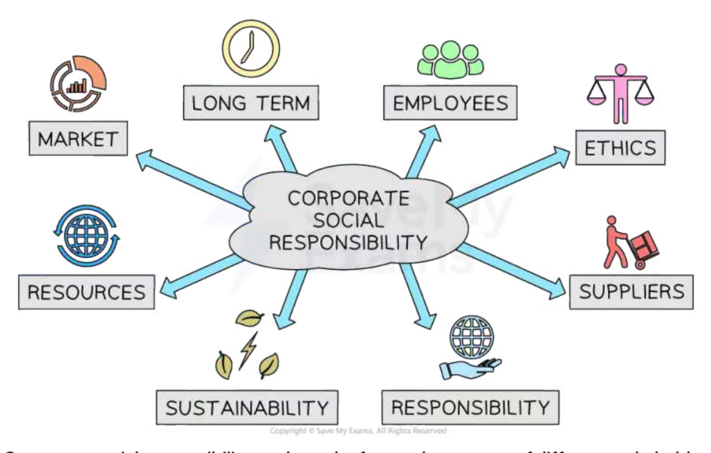
Diagram: social responsibility goals

Corporate social responsibility goals can be focused on a range of different stakeholders