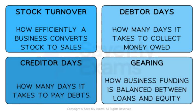
Diagram: The four main Efficiency Ratios

Efficiency ratios provide insights into the operational efficiency of a business