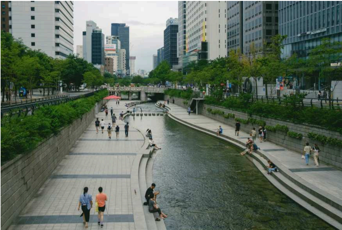
Cheong Gye Cheon River restoration project in Seoul, South Korea.