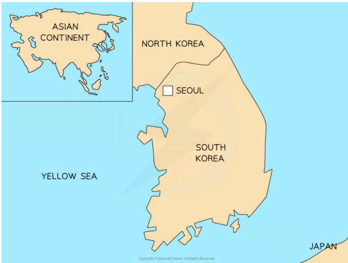
Map of South Korea