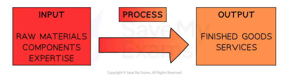
The input-output model