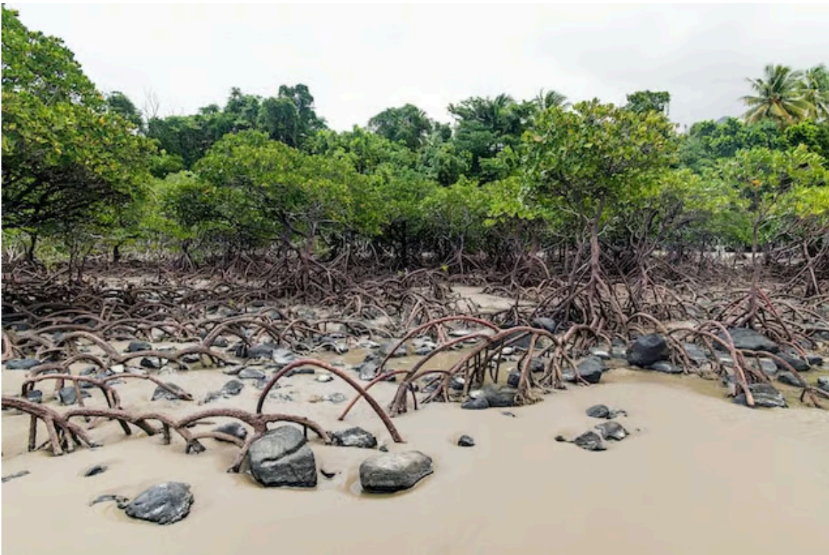
Mangrove forests act as natural buffers against flooding