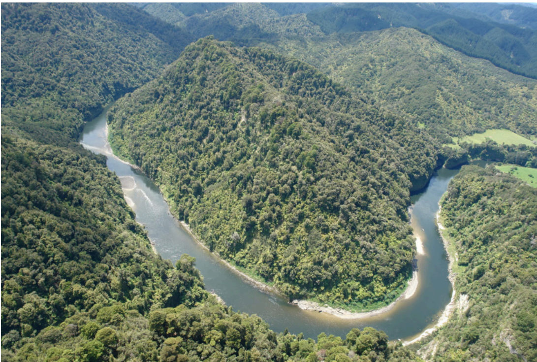
A section of the Whanganui River