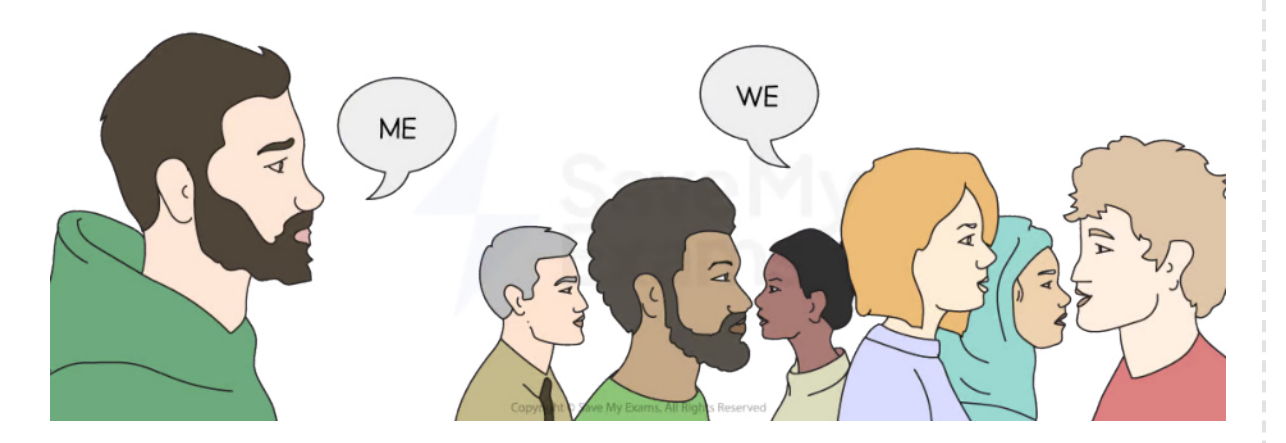
Are you a 'me' or a 'we'?