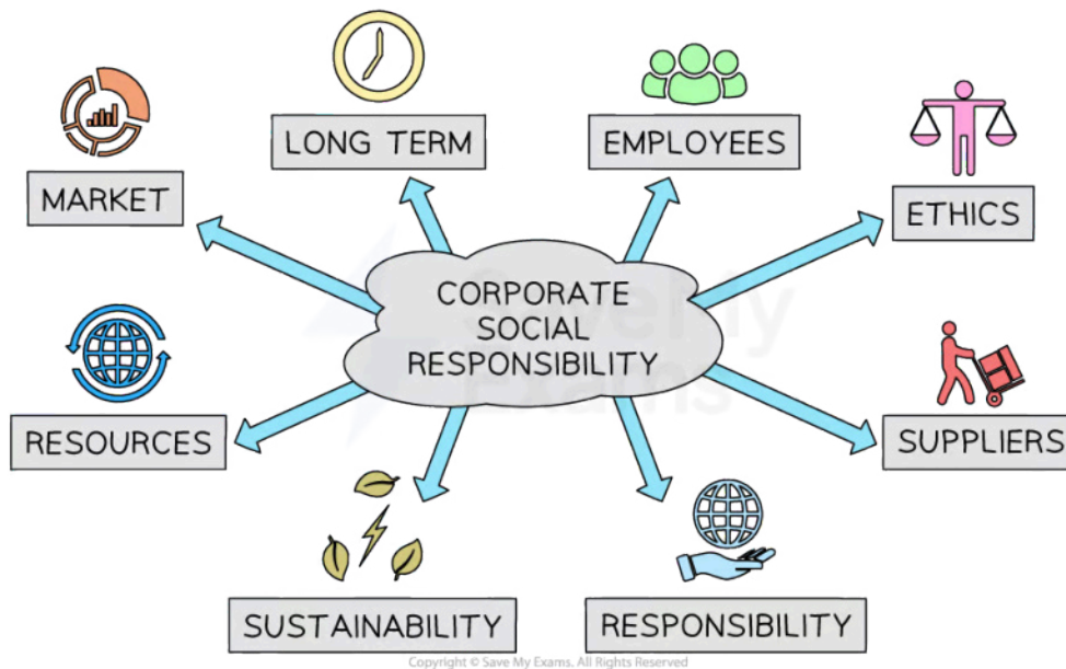
Diagram: social responsibility goals

Corporate social responsibility goals can be focused on a range of different stakeholders