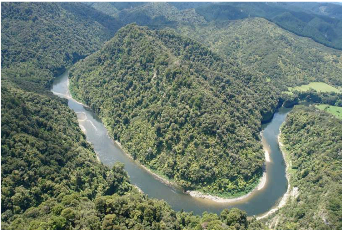
A section of the Whanganui River